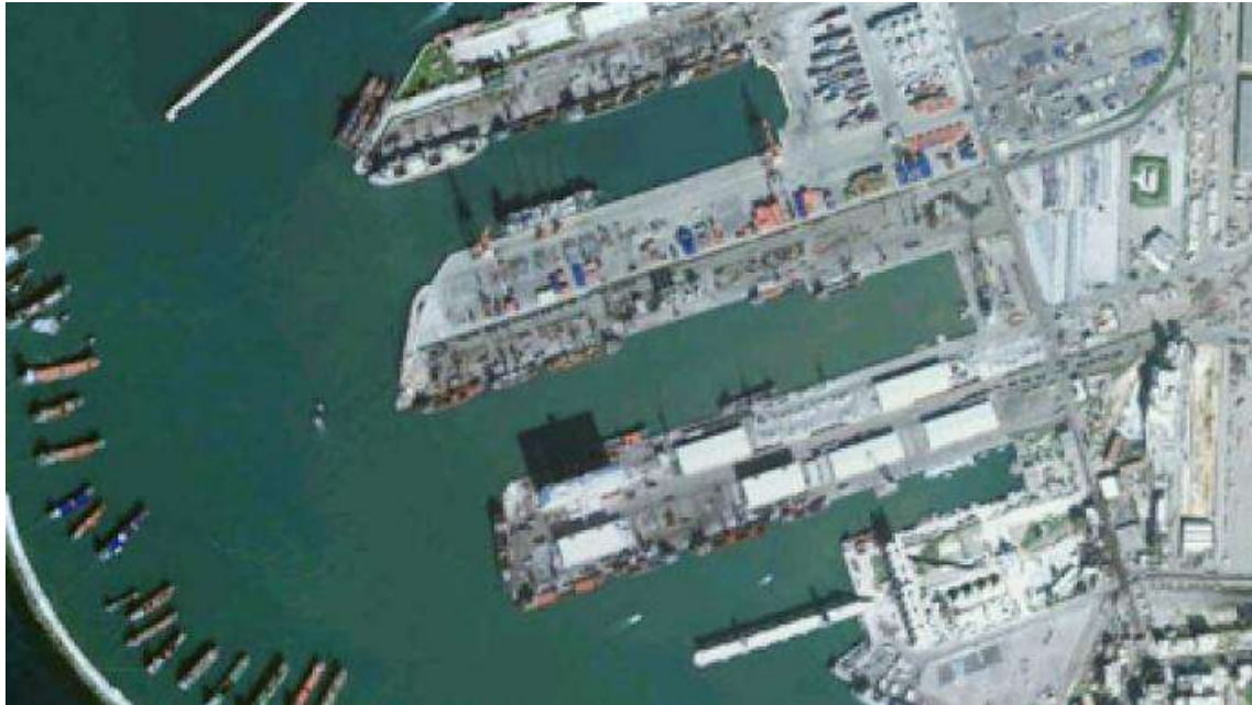
Naval base in Tartus, Syria