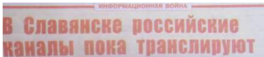
March 13: "Slaviansk retransmits Russian TV channels"

But why did this happen? Among other reasons, for the fear of suffering from a cut-off of Russian gas which would imply huge economic losses 71 .