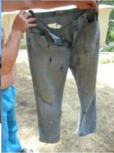
Neighbor from Gorlivka caught in a gust of separatists