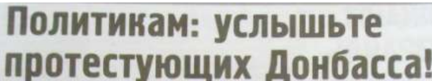
May 1: "Political hear the protests in Donbass!"

The Soviet nostalgia is evident among large social groups in the Donbass. The feeling that, in the past, the entire society worked together in defense of certain ideals and the problems of an individual were those of the whole neighborhood. The People's Republic of Donetsk and Lugansk represented a moral oasis for many citizens in a desert that lasts more than 20 years, but it was in fact an idealistic project without any economic or legal basis.