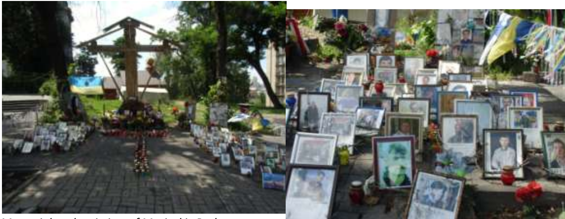
Memorial to the victims of Marinsky Park