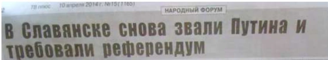
April 10: "In Slavyansk Putin's intervention and a referendum were requested"

It seems truthful that the counting of votes and the process was relatively legal, but the high turnout illustrated in the media with long queues to vote, was part of the propaganda mechanism consisting of opening only a small number of polling stations.