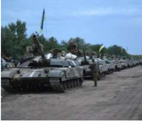
Convoy of T64A tanks of the UA in Donetsk.

The consequences are highly paid by civilians, who often find themselves trapped in their vehicles amid gunfire, isolated in their neighborhoods due to the placement of anti-personnel mines by separatists, or even surrounded by happenstance by convoys of the UA.