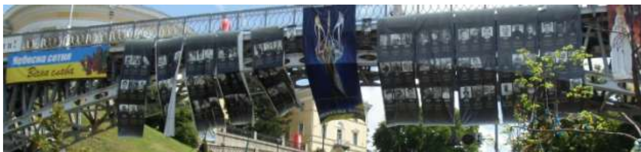
Reminder of the "Nebesna Sotnia" in the Maidan

However, the subsequent commemoration of the "Nebesna Sotnia" ("the 100 victims of the Maidan"), especially during the Soviet "Victory Day" 58 , set even greater distance between Kiev and the citizens of Donbass affected by the ATO operation who see the hundreds of victims among them not even recognized.