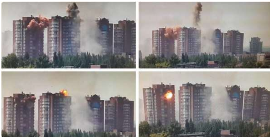
Civil damages in the city of Donetsk as shown in social networks.

Grad missiles usually carry a 6.4 kg explosive load which is fragmented into over 3000 pieces reaching within 28 m to the epicenter. The most widely used model, the 9M22U with an explosive warhead M-21-OF and maximum range of 20 km has cannot provide a better accuracy than 336mx160m. Hence, collateral damage is almost inevitable. (Read Annex IV)