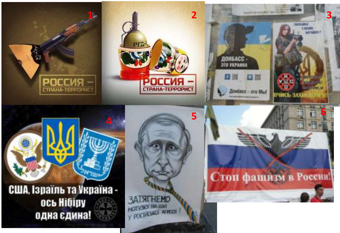
1.2. Russia, terrorist country 3. The Donbass is Ukraine; Do you love your Ukraine? Then learn how to defend it! 4. USA, Israel and Ukraine are one! (it is necessary to remember the great number of Jewish citizens living in Ukraine, or having relatives in Israel) 5. Let's suffocate the Russian aggression! 6. Let's stop fascism in Russia!