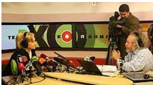
interview with Hillary Clinton in 2009

Nevertheless, the mass media analysis ( SMI ) 22 who published the most relevant stations contrary to the regime's policy during the current crisis Ukraine placed Ekho Moskvy on top of the list. The reason: its "negative relationship to Russia and its support for the US position" 23 .