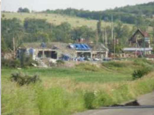
Public services and critical infrastructure have suffered greatly during the blitz. Starting from top left: a bridge, a power station a school and a hospital ravaged by the war.