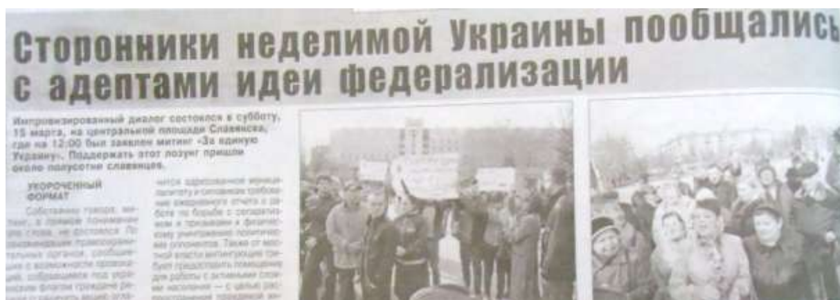
Slaviansk, March 20: "Pro Ukrainians make contact with pro-Russian"

The longing of the Soviet Union, during which miners obtained good wages thanks to the premiums proportional to the physical risk involved in the job, was catalyzed by the acquisition of mines by the oligarchs. These register their companies in other oblasts (offshore policy) where they enjoy tax benefits, thus distorting economic data in Donbass.