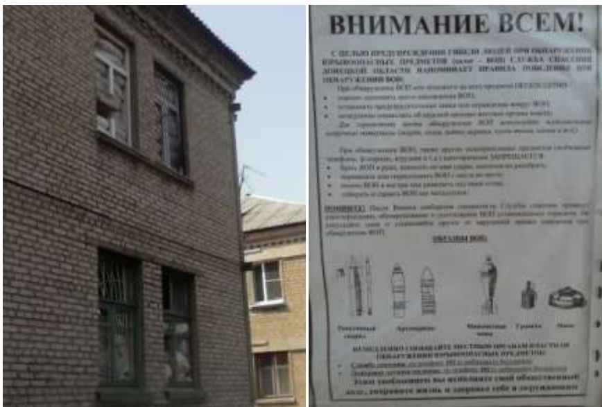
Life under siege: entrenched houses and public warnings of mine attack.

In the town of Schaste 20 kms from Lugansk, for example, to the psychological burden of the flight, IDPs suffered from the psychological stress if witnessing the missile launching by the UA which can reach their relatives or acquaintances.