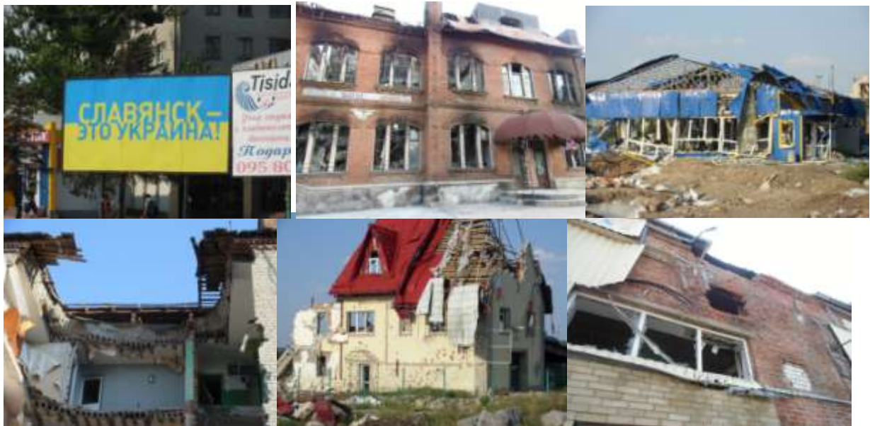
Attacks in the town of Slavyansk, Donetsk province. In the first picture, the slogan that the UA placed in each city liberated "Slavyansk is Ukraine!"

Separatists installed bases in schools, hospitals and residential areas ( chastniy sektor ), to challenge the strength in the response of the UA. But MLAC violations by the enemy, do not justify your owns. The UA's strategy of attacking the separatists from the outskirts of cities to minimize the number of casualties is causing nonetheless hundreds of avoidable civilian casualties.