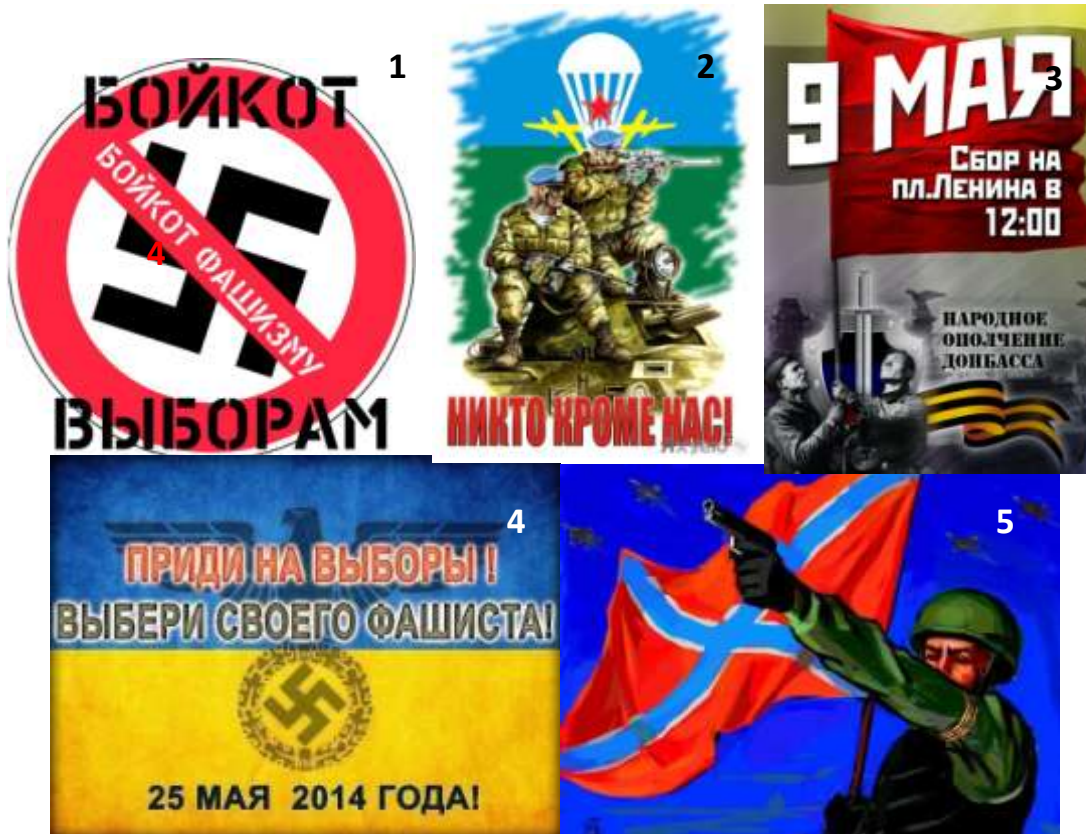
1. Boycott to fascism. Boycott to elections. 2. No one except us!.3. 9 May (Victory Day) Popular militias of Donbass. 4.Participate in the elections! Chose your fascist!