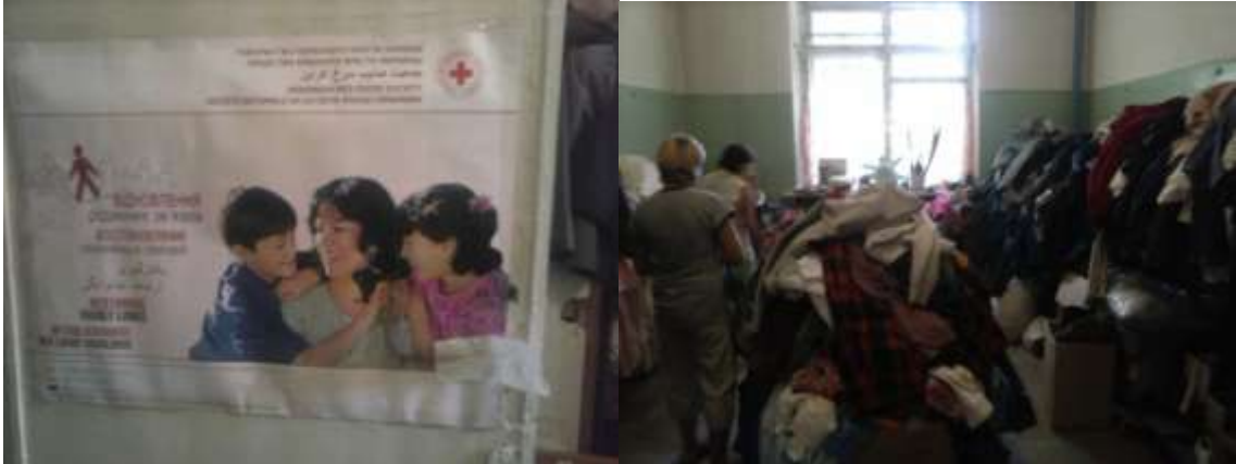
Displaced center of the Red Cross in Severodonetsk

Likewise with the children, whose insertion into local schools is imperative, as it reduces their exposure to the mentioned violence. Only in Kharkiv, for example, more than 6,500 children from the Donbass demanded registration.