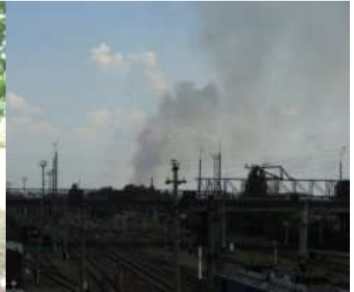
Missile explosion near in the liberated city of Konstantinovka