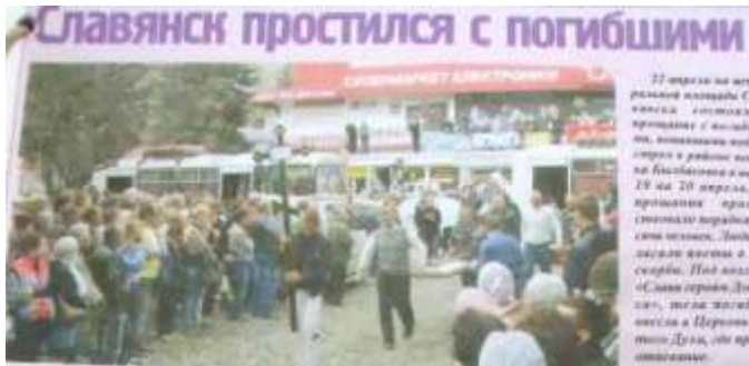
22 April, first clashes: "Slaviansk gives the last farewell to the deceased heroes of Donbass"

As for the political authorities of the liberated cities, they show nowadays a sudden Ukrainian patriotism that did not exist earlier. They deny any link with the separatists, and claim having been extorted due to their stubborn defense of the national constitution.